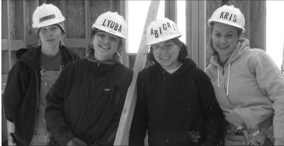
Participants from the Oregon Tradeswomen, Inc., Brownfields Job Training Program