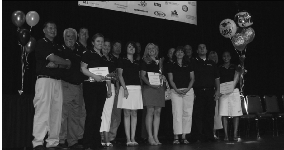
Students Graduating from Tucson, Arizona's, Job Training Program