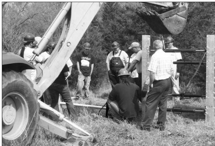
Students in the Absentee Shawnee Tribe Brownfields Job Training Program, participating in onsite training