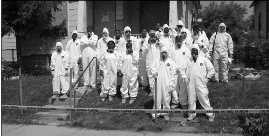
The Milwaukee Community Service Corps Job Training Class on site